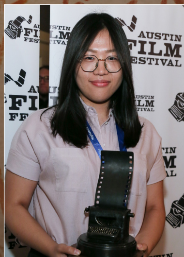
Siqi Song, writer/ director 2018 AFF Animated Short SISTER, 2020 Oscar® nominee

"The recognition from Austin Film Festival definitely brought the film into the spotlight and gave it more opportunities to be seen as it was shared in many other film festivals. Attending the Austin Film Festival was one of my best film festival experiences."