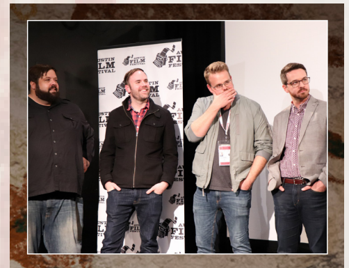
Wade in the Water cast and crew walking the red carpet at AFF 26